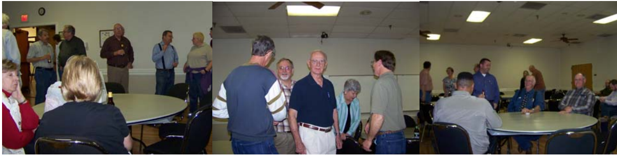
PSSAT members socializing before the meeting.